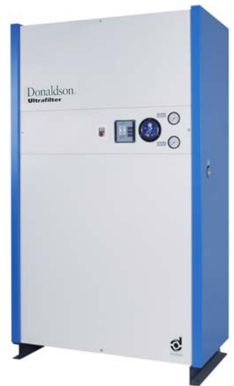
Purification package OFP

In case of an immediate increase in differential pressure, the differential pressure gauge triggers the control and a valve (9) is closed.